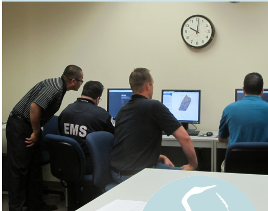
Training on District town maps