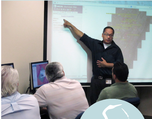
Training on District town maps